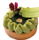
抹茶麻糬紅豆撻 Matcha Red Bean Mochi Tart