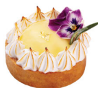
柚子蛋白霜撻 Yuzu Meringue Tart