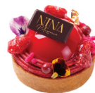
紅桑子開心果布丁撻 Raspberry Crème Brûlée Pistachio Tart