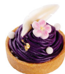
紫薯黑糖麻糬撻 Purple Sweet Potato with Brown Sugar Mochi Tart